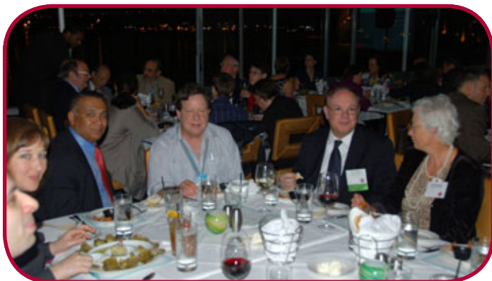
Enjoying dinner at Peohe's on Coronado Island.